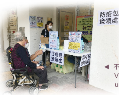
◀ 不同服務單位向基層人士派發防疫包。 Various service units are distributing care packs to underprivileged families.

當中長者照顧服務收到捐贈或成功採購逾 177,000 個口罩、逾 3,500 支酒精搓手液、2,749 份「關懷包」及 1,500 份「防疫包」，送到本會 16 個長者照顧單位，超過 2,460 個服務使用者手上。而 50+ 悅齡服務亦向獨居長者、體弱長者、認知障礙症患者以及照顧者派發逾 22,000 個口罩和其他防疫用品。