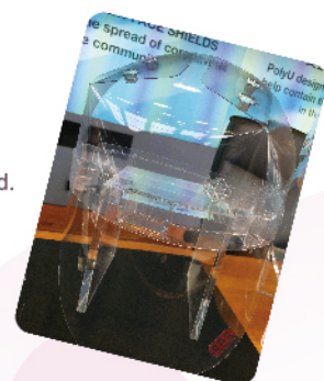
► 理大研發面罩。 Poly U Face-Shield.

We also participated in the pilot scheme on the trial of "Poly U Face-Shield of General Version" organised by the Hong Kong Polytechnic University. During the trial, we provided lots of feedback and suggestions for developing the "Poly U Face-Shield of Enhanced Version", which could be widely used in community care services. In recognition of our contribution, the Hong Kong Polytechnic University dispatched part of the first batch, totalling 200 face shields, to our service units.