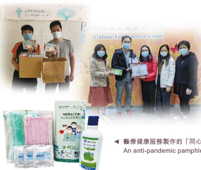
◀ 醫療健康服務製作的「同心抗疫小錦囊」。 An anti-pandemic pamphlet published by our Medical and Health Services.

除了防疫物資，本會醫療健康服務製作了「同心抗疫小錦囊」，鼓勵市民注意個人衛生及防止疾病傳播。