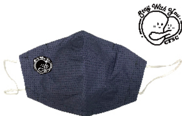
▲ 備有 CFSC 標誌的改良版 HK Mask。 The modified HK Mask with CFSC's logo.

我們亦參加香港理工大學的「理大研發面罩—通用版」試用計劃；在試驗中，我們提供了不少意見，隨後發展出「理大研發面罩—加強版」，給社區服務使用。本會並獲得香港理工大學首輪贈送 200 個「理大研發面罩」予本會各單位使用。