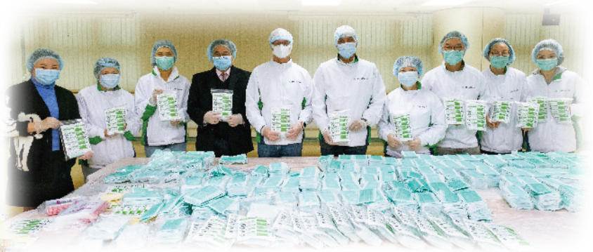
▲ 宏利義工包裝 10,000 個口罩，送贈東九龍區的基層家庭。 10,000 face masks were individually packaged by a group of Manulife volunteers and distributed to disadvantaged families in East-Kowloon district.