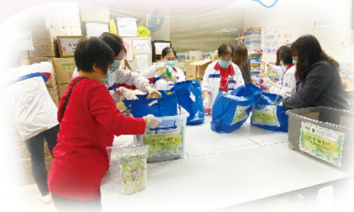
▲ 馬會義工隊身體力行，協助準備及包裝「關懷包」送贈予弱勢社群。 Care packs were prepared and packaged by HKJC Volunteer Team and delivered to the underprivileged.