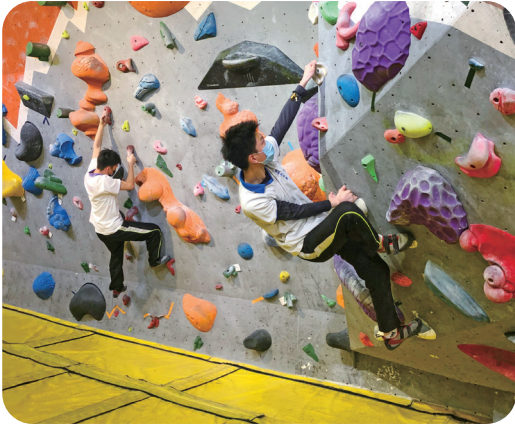
▲ 學生參與抱石活動放鬆一下心情。 Students enjoyed a bouldering activity to let off some steam.