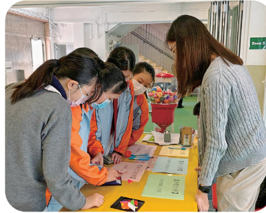
▲ 社工透過舉辦活動讓學生認識自己的情緒。 Students explored their emotions during an event organised by social workers.

Young people, who are often going through many struggles in life, are especially vulnerable to this issue. Thus, the social workers stationing at two of the schools we are serving applied “Emotion Focused Therapy” to help students reconnect with their emotions and recognise their needs via face-to-face counselling sessions, and took actions to respond to their needs. With a total attendance of 80 people, the sessions were aimed at allowing young people to thrive on healthy bodies and minds.