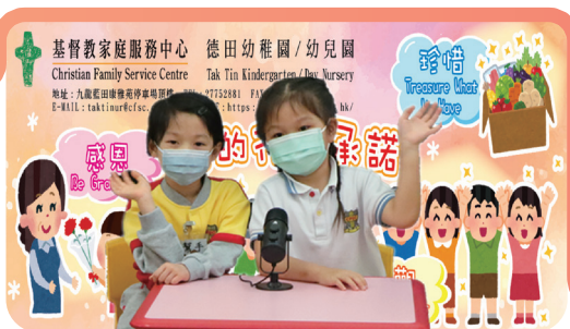
▲ 小小廣播員向同學分享生活中的好人好事，散播快樂正能量。 The little broadcasters spread happiness and positivity by sharing stories of kind acts with their fellow students.

德田幼稚園及趣樂幼稚園申請優質教育基金推行「我的行動承諾—感恩珍惜•積極樂觀」計劃，並成功獲撥款，為兩校合共216位學生舉辦一系列有趣及多元化活動，包括承諾日、快樂廣播站、綜合藝術、親子大自然活動等。幼兒由承諾日開展正向活動，尋找正向生活四大元素，共同經歷十節的活動，以培育他們正面的價值觀和態度，為生活注入多一點正能量。