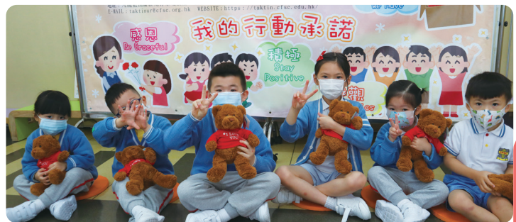
▲ 小朋友抱着自己命名的小熊作行動承諾。 Children made a pledge to act while holding a bear they had named.

Supported by the Quality Education Fund, Tak Tin Kindergarten and Cheerland Kindergarten co-organised a programme titled “My Pledge to Act – Be grateful and treasure what we have, stay positive and optimistic” in 2022. A variety of engaging and diverse events were held for 216 children attending the two kindergartens, ranging from the Pledge Day and Happy Broadcasting Station to integrated arts and family-friendly nature activities. Starting with the Pledge Day, the children participated in 10 sessions of activities intended to foster positive values and attitudes and enrich their lives with positivity, which included exploring the four elements of positive living.