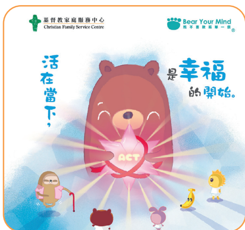
▲《活在當下，是幸福的開始》自創繪本，基於「接納與承諾治療（簡稱ACT）」的概念編著。“Present Living is the Beginning of Happiness” is an original picture book inspired by the concept of Acceptance and Commitment Therapy.