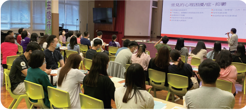
▲「心情行動」接納與承諾治療手法專業培訓講座。 “Smile ACTION” Workshop for Professionals.