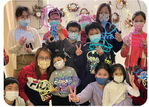
▲親子燈飾製作工作坊 A lamp-making workshop for families