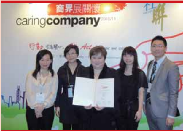
歐萊雅香港有限公司 L'OREAL Hong Kong Ltd.