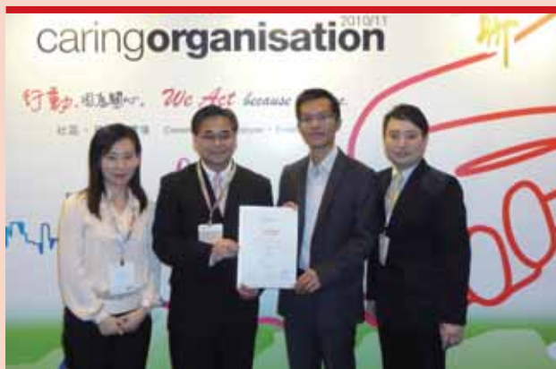
香港機場管理局 Airport Authority Hong Kong

Photos taken with our partners at the Caring Company Award Presentation Ceremony: