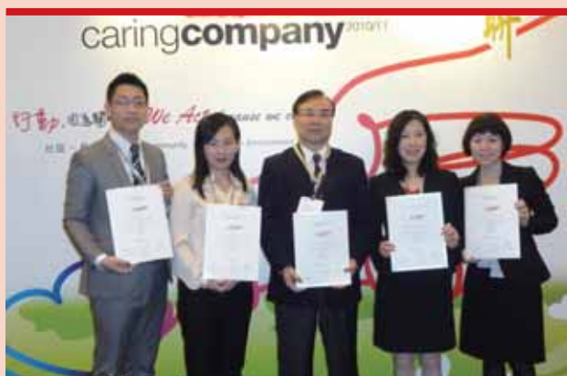
和記黃埔地產有限公司 Hutchison Whampoa Properties Limited