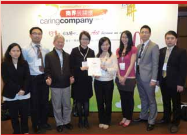
索尼香港 Sony Corporation of Hong Kong Ltd.