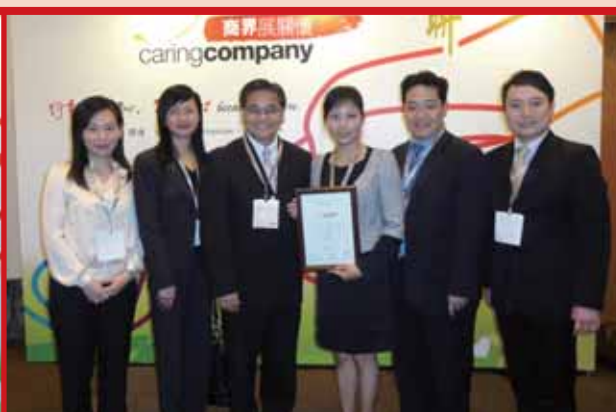
銀聯信託有限公司 Bank Consortium Trust Company Limited