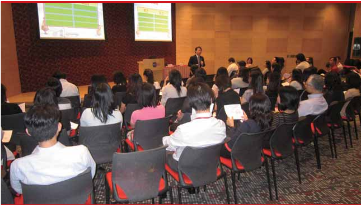
香港交易及結算有限公司透過服務簡介會向員工介紹「僱員輔導熱線」。

Besides, some customers renewed their contracts with Vital including the "Hotline Counseling Service for Civil Servants" under Civil Service Bureau, the "Teachers' Helpline" under Education Bureau and the EAP under MTR Corporation Ltd.. It was encouraging to have the support and appreciation to our services from both the public and business sectors.