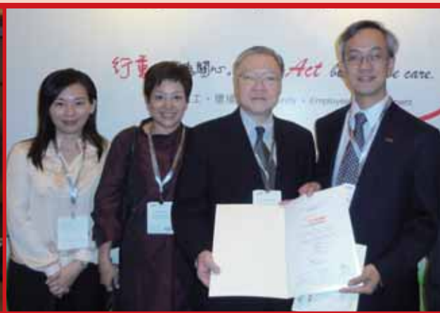
香港貿易發展局 Hong Kong Trade Development Council