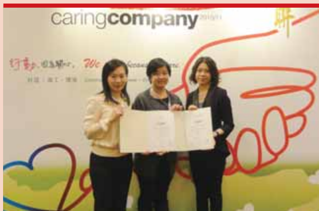
城巴有限公司及新世界第一巴士服務有限公司 Citybus Limited & New World First Bus Services Limited