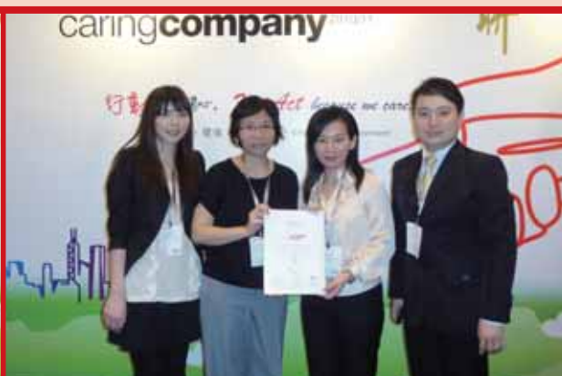
縱橫二千集團 The G2000 Group