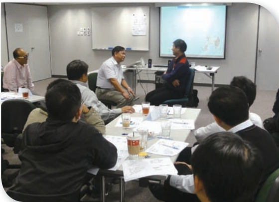
香港中華煤氣有限公司管理級員工在工作坊中練習僱員指導技巧。 Managerial grade staff of The Hong Kong and China Gas Company Limited were practicing coaching skills in the workshop.

自 1993 年起，盈力僱員服務顧問致力為香港不同類型的機構提供僱員輔導及職場培訓服務，目的是為職場注入健康及活力的色彩，從而提高公司生產力，增加員工歸屬感。我們的主要服務包括：僱員輔導、危機處理、在職培訓、工作生活平衡活動等。至今，我們已經服務接近 400 間機構，包括政府部門、公營機構及商業公司，而僱員輔導服務更涵蓋超過 30 萬名僱員，相信是目前全港最大規模的僱員輔助計劃 (EAP)。