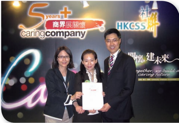
香港鐵路有限公司 MTR Corporation Limited