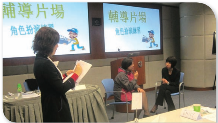
和記黃埔地產有限公司員工在僱員輔導技巧工作坊中積極參與角色扮演。 Staff of Hutchison Whampoa Properties Limited actively participated in the role play session in the Workshop on Peer Counselling Skills.