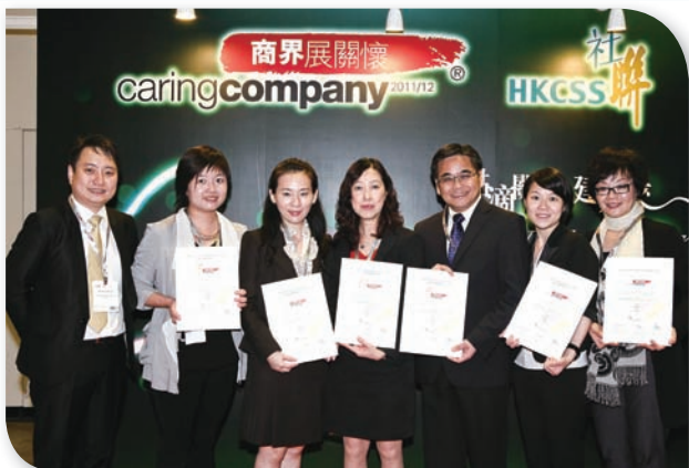
和記黃埔地產有限公司 Hutchison Whampoa Properties Limited