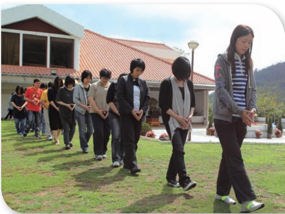
勞工處員工在退修營中體驗靜觀減壓。 Staff of Labour Department experienced mindfulness in Staff Retreat Day.

Over the past year, Vital provided various topics of training workshops for different customers. We have 30 new customers using our training service including Cerebos (Hong Kong) Limited, Miramar Hotel and Investment Company Limited, Cinda International Holdings Limited, SANYO Electric (Hong Kong) Limited, Yan Oi Tong, etc. The most popular topics were Staff Supervision and Coaching Skills, Gen-Y Management Skills, Team Building and Customer Service.