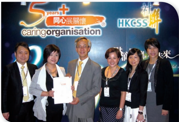
香港貿易發展局 Hong Kong Trade Development Council