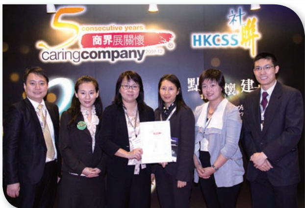
捷成洋行有限公司 Jebsen & Company Limited