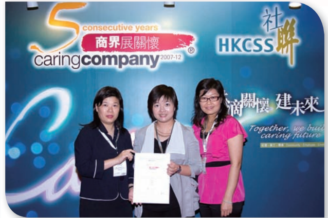
昆士蘭聯保保險有限公司 QBE Hongkong & Shanghai Insurance Limited