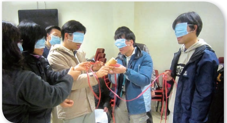
環境保護署員工在壓力管理工作坊中參與解難遊戲。 Staff of Environmental Protection Department participated in the problem-solving game in the Workshop on Stress Management.

Vital Employee Service Consultancy has been providing services to the employees of various organisations with the aim of improving their work productivity and quality of life since 1993. Our major services include employee counselling, critical incident management, staff training, work-life balance activities, etc. We have provided services for nearly 400 organisations including government departments, public organisations and business companies. Possibly the largest Employee Assistance Programme (EAP) service provider in Hong Kong, the existing coverage of our employee counselling service is over 300,000 employees.