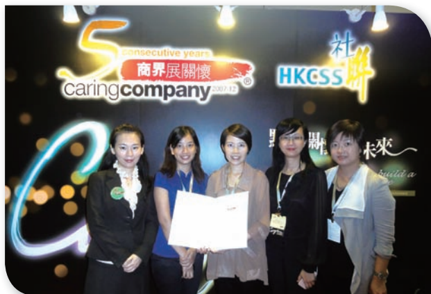
牛奶有限公司 – 宜家家居 The Dairy Farm Company Limited - IKEA