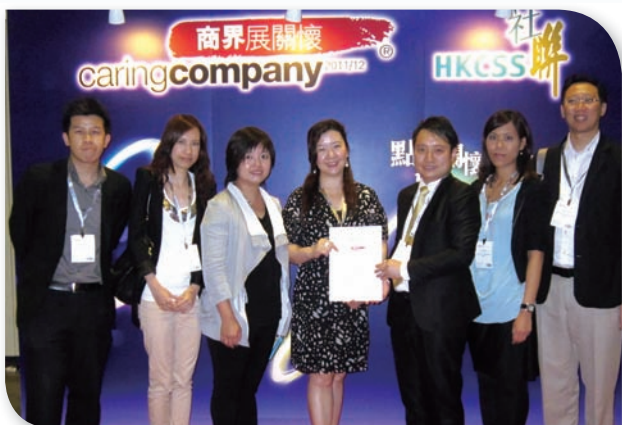
百麗國際控股有限公司 Belle International Holdings Limited

Photos taken with our partners at the “Caring Company” NGO Partnership Day: