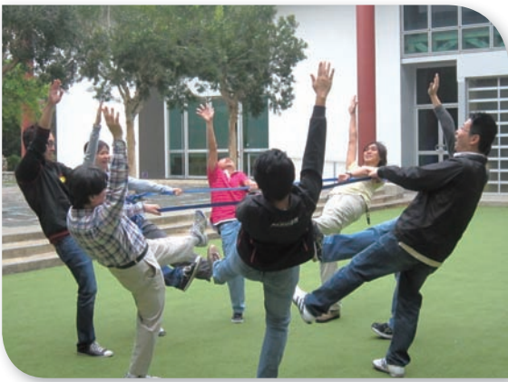
地政總署員工在團隊建設日營中非常投入。 Staff of Lands Department enjoyed the Day Camp on Team Building.