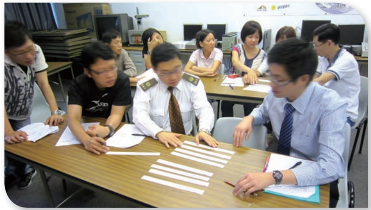
香港西區隧道有限公司員工在顧客服務工作坊中進行小組討論。 Staff of Western Harbour Tunnel Company Limited made group discussion in the Workshop on Quality Customer Service.