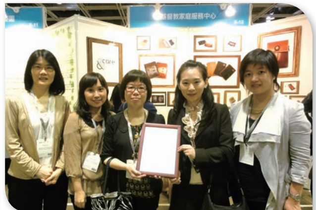
強制性公積金計劃管理局 Mandatory Provident Fund Schemes Authority

為繼續提高盈力僱員服務顧問的優質服務，我們將不斷改善現有服務，並引入更多專業的服務元素，促進僱員工作表現與生活質素，為職場注入色彩。我們相信，以同工的豐富經驗及委身精神，盈力在未來一年必定能夠創出更好的成績。