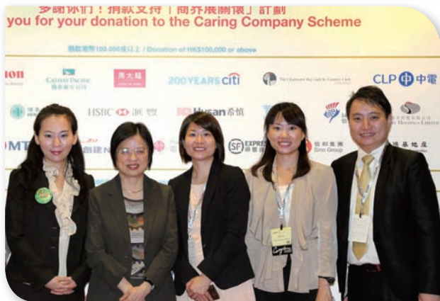
九龍巴士 (1933) 有限公司 The Kowloon Motor Bus Company (1933) Limited