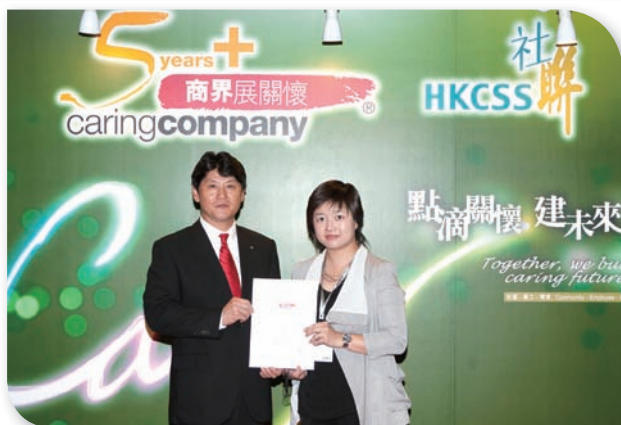
佳能香港有限公司 Canon Hongkong Company Limited