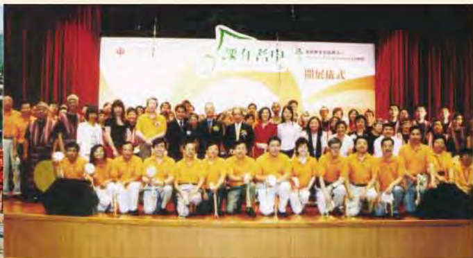
▲ 香港電燈有限公司與本會攜手開展「樂在耆中 - 音樂共享計劃」 Hongkong Electric Company Limited & the Agency jointly launched the "Joy & Care Music Programme for the Elderly"