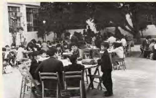
▲ 學校社會工作 - 學習中心 School Social Work - Learning Centre

Yang Chen House, the Agency's first home for the elderly, commenced operation in 1972 to provide comprehensive caring services for single men who took refuge in Hong Kong and contracted lung disease in old age. Also, the Elderly Mutual Help Centre, which aimed to encourage the elderly in the community to better use their time and potentials and live group life, and Home Help Service, which provided daily care for the needy elderly referred by district groups and hospitals, began to operate in 1977 without government aid.