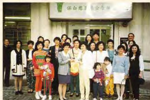
▲ 香港東區崇德社參觀任白慈善基金景林安老院 Unit Visit of Yam Pak Charitable Foundation King Lam Home for the Elderly by the Zonta Club of Hong Kong East