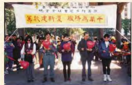
▲ 總會會址重建步行籌款剪彩儀式 Ribbon cutting ceremony in the Charity Walk for the reconstruction of headquarters building

Although we were engaged in fund raising, building design and office arrangement while preparing for the rebuilding project, we never relaxed our efforts to develop our services to meet social needs.