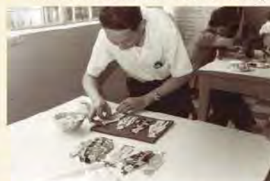
▲ 著重助人自助的手工部，主要以外發衣物形式讓市民在家縫製，按件計算工資。及後更訓練製作精巧之手工藝品，經銷海外，備受讚賞。 The Handicraft Department aimed to promote self-reliance, assigned sewing homework and paid them on piecework basis. The Department trained people to make exquisite handicrafts, which were exported and well received overseas.