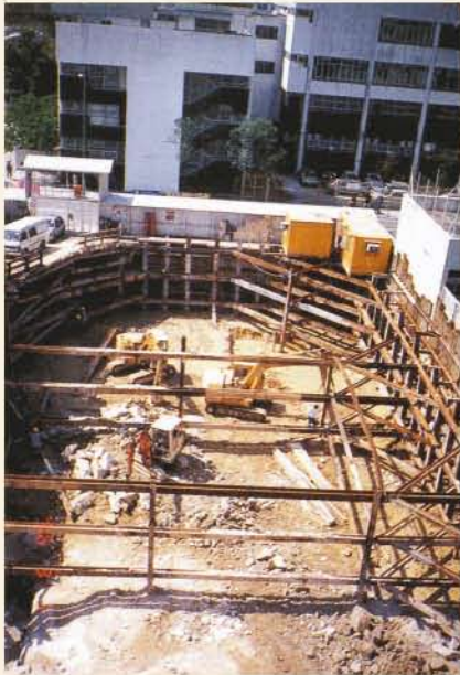
▲ 總會會址重建之地盤面貌 Construction site of the new headquarters building