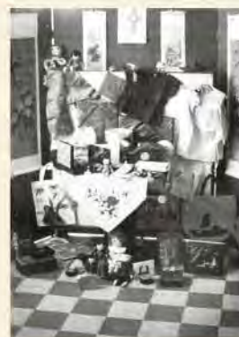
▲ 位於太子道的手工藝品陳列室 Handicrafts display at a showroom in Prince Edward Road