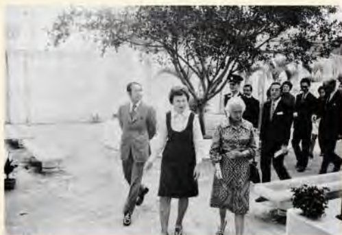
▲ 1972年麥理浩督憲夫人參觀老人互助中心 On-site Visit of Elderly Centre by Lady Macleahose in 1972

In view of the gradually improving livelihood of Hong Kong people in the 1960s, the Agency shifted its focus from relief work to diversified family services, especially the relations and specific needs of families in new towns. The Agency tried different methods, including personal and group counselling, to help tackle increasingly complex personal and family issues, and provided assistance for needy students and their families upon request of schools. In 1976, the Agency started to provide Family Life Education Service to advocate harmony among family members and reduce domestic problems.