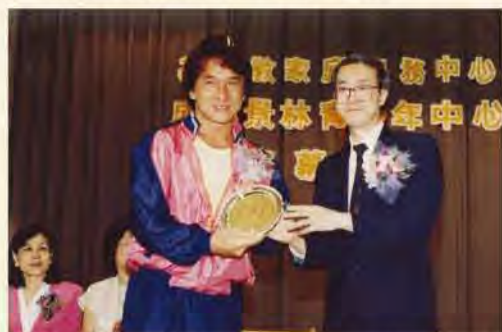
▲ 「成龍慈善基金」資助開辦「成龍景林青少年中心」 "The Jackie Chan King Lam Children & Youth Centre" was established and funded by "The Jackie Chan Charitable Foundation" to be established