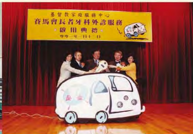
▲ 2001年「賽馬會長者牙科外診服務」啟用典禮 Kick-off Ceremony of "The Jockey Club Mobile Dental Service for the Elderly" in 2001