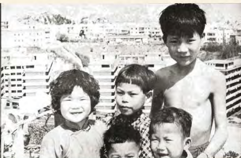
▲ 長老會福利部 - 為內地難民提供服務的家庭中心 Presbyterian Casework Centre - A Family Centre for Mandarin Refugees