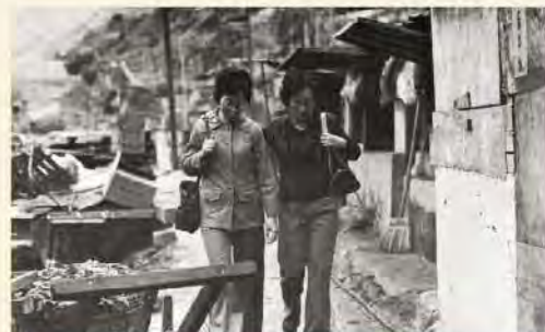
▲ 護士及社會工作員聯同探訪 Joint visit by a team of nurse & social worker