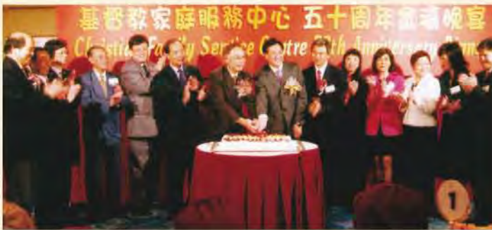
▲ 衛生福利及食物局局長周一嶽太平紳士出席本會五十週年金禧晚宴 Dr. York Y. N. Chow, J.P., Secretary for Health, Welfare and Food attended the Agency's 50th Anniversary Dinner

In 2008, the Agency further integrated its service systems and reviewed the social missions and focuses of its services with a view of meeting the new service needs brought by social changes. The Agency had now more than 800 employees.