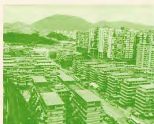
▲ 觀塘翠屏邨（又名「雞寮」） Tsui Ping Estate, Kwun Tong (commonly known as "Kai Liu")

Always committed to addressing the health needs of residents, the Agency set up the Health Centre in 1965 to provide residents with such services as health checkup, health counselling and community health education. The health services had also all along cooperated closely with our social services, including children's centres, family life education, elderly services, community development services and industrial social services, in a bid to disseminate health information and make the citizens understand the importance of prevention and early treatment of diseases. In 1982, the Health Centre began to provide Outreach Health Programme to other organisations in need.