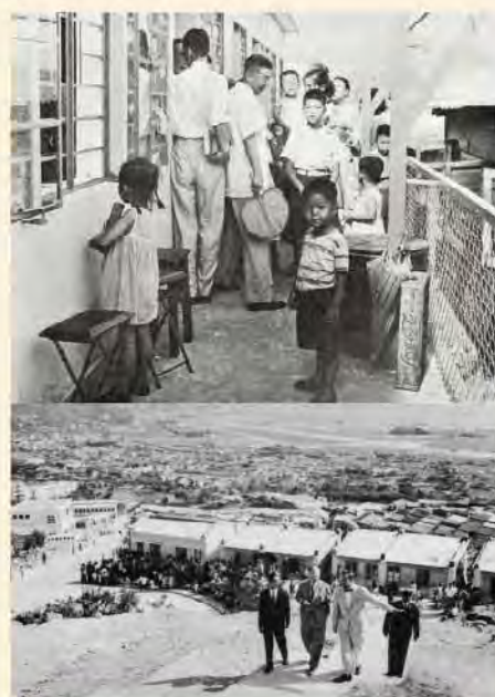
▲ 1956年本會建造之竹園平房 Historical outlook of constructed Chuk Yuen cottages housing in 1956

The financial source of the Agency in its early days came from various agencies and enthusiasts as well as American Presbyterian Church.