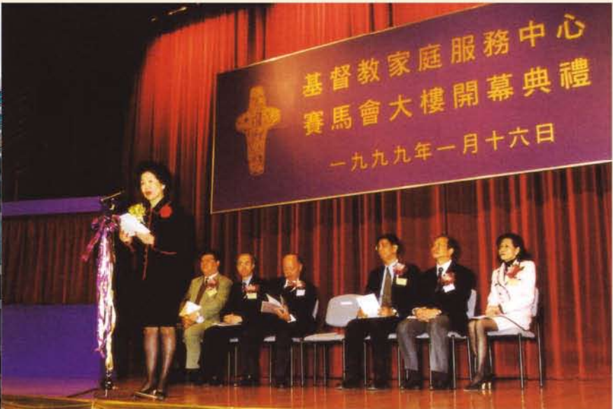
▲ 重建後的總部大樓開幕典禮 Opening Ceremony of the Headquarters Building after Re-construction