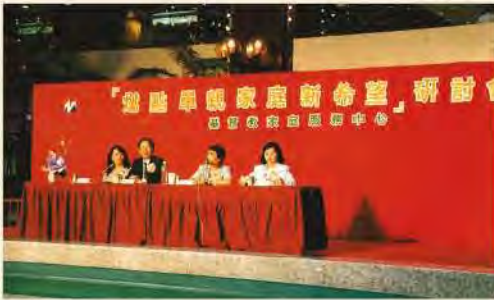
▲ 在「燃點單親家庭新希望」研討會上，講者分享他們的見解 Speakers shared their views at the Seminar on "Love & Care for the Single-parent Families"

香港的離婚率在七、八十年代已開始逐步上升，為回應陸續湧現的社會需要，本會無懼於社區人士對「單親」二字的忌諱，於1984年率先推出「單親家庭服務」。面對著社會上愈趨複雜的家庭問題，社會福利署遂於1987年撥款設立「臨床心理服務」，為有問題的家庭及個人提供更深入及專業的心理治療服務。1990年則開辦家務指導服務，協助受助人處理家務及建立良好的生活習慣。