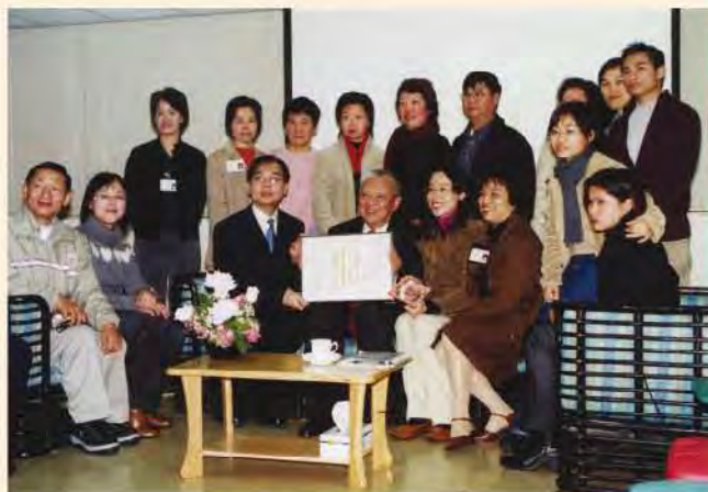
▲ 2001年，本會獲社署資助開辦「勵志單親中心」，為單親人士提供各類支援服務。 "Lai Chi Single Parent Centre" was funded by Social Welfare Department to set up in 2001 for providing various support services to single parents.

The new headquarters provided much larger space for service development in line with varied service needs in a rapidly changing society. With the support from the Social Welfare Department, other funding bodies and the self-financing mode of service, our scope of services has been extended from Kowloon East to Hong Kong Island and New Territories. The new service units developed in the past ten years are listed in the annex as a record. To provide one-stop and cost-effective services, the Agency also stepped up cooperation and coordination among service units for better integration.