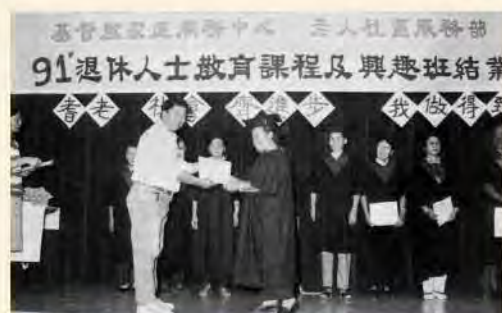
▲ 畢業禮是一個值得紀念的日子 A good memory to cherish - Graduation Day

The Industrial Social Service developed by the Agency since 1979 was eventually extended to four factories in Kwun Tong with their financial assistance in 1988. In response to the changing needs of employers and employees in Hong Kong, the Industrial Social Service was transformed to Employee Service Programme in 1993 to help employers address the needs of employees in work and family life. The target group was also extended from factories to public and private organisations.