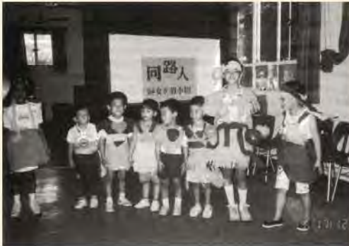
▲ 笑聲，淚影……「同路人」的孩子們，暫時忘卻了成長於暴力家庭的哀傷 An Activity of the Self-Help Group for Abused Women – Members' Children Gathering for Fun

至此，本會的家庭服務從預防、教育、治療至危機處理等都愈趨多元化，為有需要的家庭提供一站式的服務。