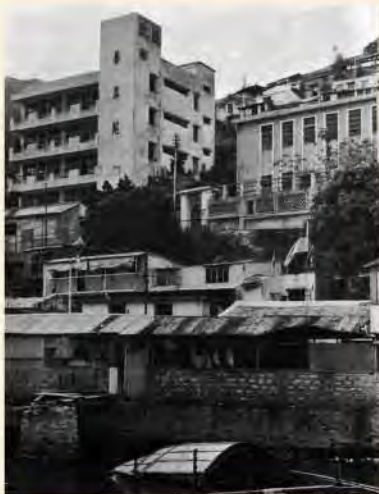
▲ 養真苑 Yang Chen House