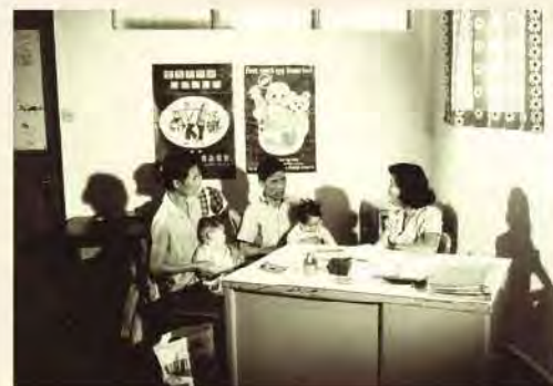
▲ 於1965年成立「健康中心」，為居民提供健康檢查、健康輔導及社區健康教育等。 The Agency set up the Health Centre in 1965 to provide residents with such services as health check-up, health counselling and community health education.