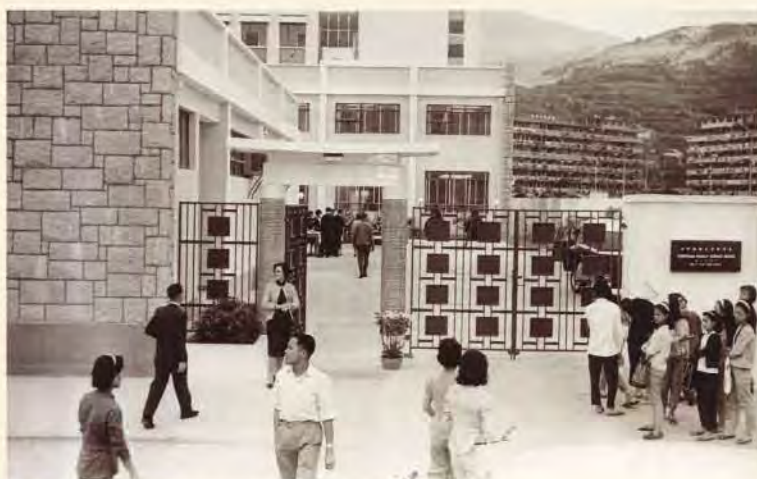
▲ 「基督教家庭服務中心」舊貌 Historical Outlook of "CFSC"

In 1967, the Agency began to get subsidies from the government and the Community Chest. With the support of government, we achieved sustained development in services.