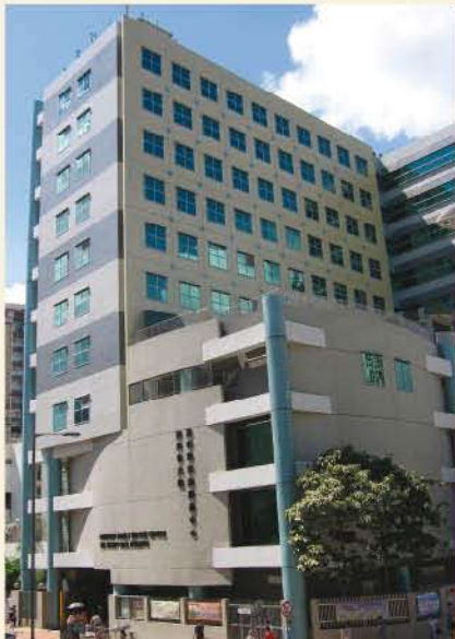
▲ 「基督教家庭服務中心」現貌 Present Outlook of "CFSC"