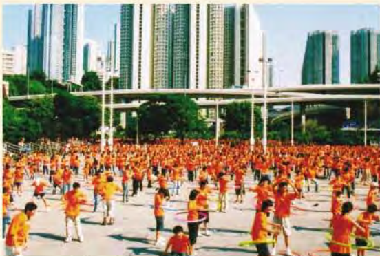
▲ 齊搖呼拉圈慶祝本會50週年 Hula Hooping celebrating the Agency's 50th Anniversary