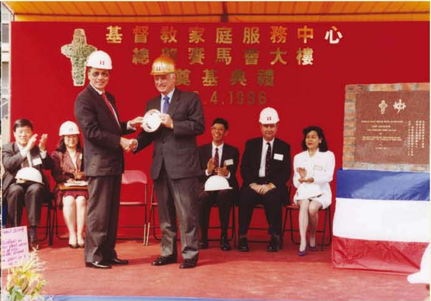
▲ 1996年「總部賽馬會大樓」奠基典禮 The Foundation Stone Laying Ceremony of "The Jockey Club Headquarters Building" in 1996