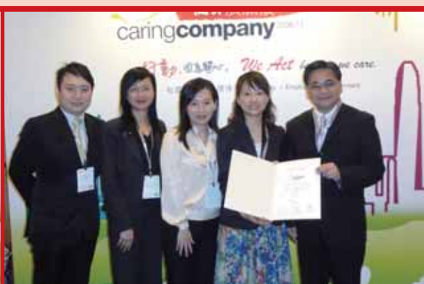
九龍巴士(1933)有限公司 The Kowloon Motor Bus Co. (1933) Ltd