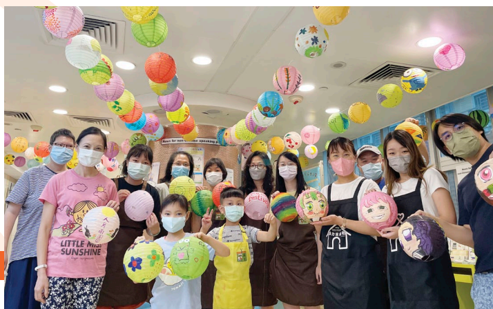
The service users of Family Energizer, together with a volunteer team, embellished the centre with various decorations, conveying positive energy through rich colours.

Learn more about the services offered by Family Energizer