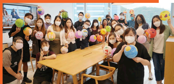
The volunteer team worked hand-in-hand with the service users to paint lanterns and decorate the centre.