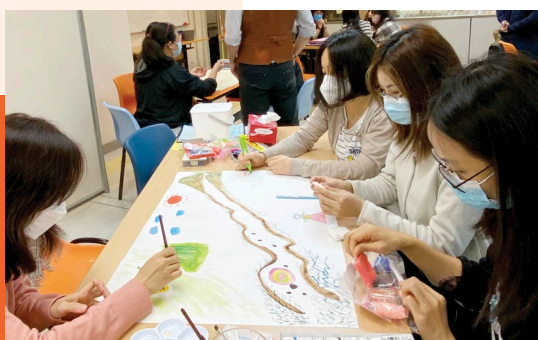
The “Walk Together for a Rough Ride” Parents Support Scheme supported parents through group activities and workshops so that they knew they did not walk alone.