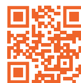
Learn more about the “Together Walking through the Stormy Days – Parents' Learning Platform”

According to the latest statistics from the newly registered child protection cases, the number of child abuse cases in 2022 has surged by 37% compared to the pre-pandemic period. The Kwun Tong district stood out as the area with the highest number of reported child abuse cases in Hong Kong, highlighting the significance of addressing parent-child relationships as a crucial issue. Since 2021, we have launched the “Together Walking through the Stormy Days - Parents' Learning Platform” to help parents overcome conflicts with their teenage children by taking part in various activities. Last year, we also continued with our “Walk Together for a Rough Ride” Parents Support Scheme, which was built on the theory of existential-humanistic psychology; through parent groups, workshops, movie appreciation sessions, and talks, we strove to walk side-by-side with the parents on their parenting journey. We have served over 500 people via the scheme since its launch. To achieve a long-term improvement in parent-child relationships, dedicated support groups for parents with teenage children were established to maintain a mutual support network and consolidate the positive changes brought about by the scheme.