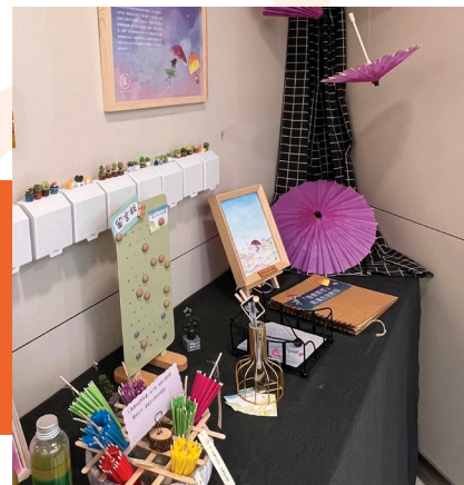
The Parent Education Corner regularly updates its decoration to share various themes related to child-parenting.