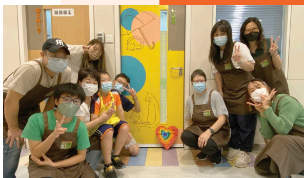
The centre doors were turned into canvases, with a cute and simple art style that conveys the warm feeling of “Home”.