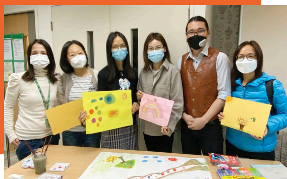
Mothers took advantage of their leisure time to express themselves through art and enjoy some me-time.