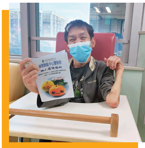
Staff members could take a resident's emotional temperature based on their “personal emotional passports”.

Learn more about our services at Dick Chi Day Activity Centre cum Hostel