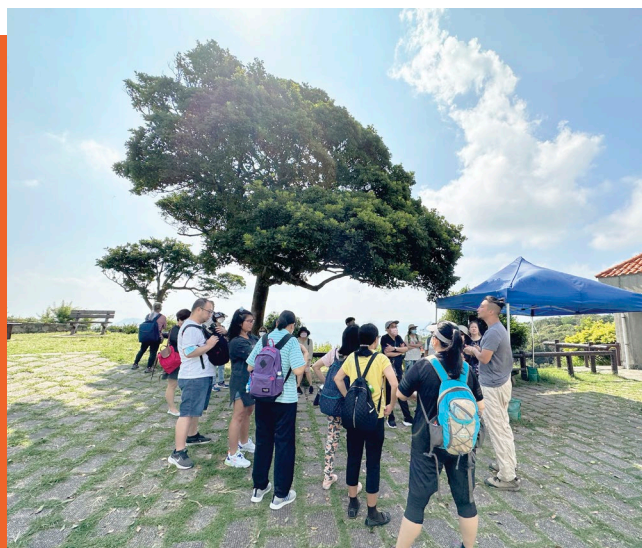
Organising a "Forest bathing tour" for carers.

With a subvention from the Kwun Tong District Welfare Office of the Social Welfare Department, we introduced a district-based carer support programme that enables carers to indulge in "me time" through a host of stress-relieving group activities and events, such as yoga and stretching classes, as well as hiking trips. This allowed more than 100 carers to unwind from their day-to-day stress and find time in their busy schedules to prioritise their own mental, physical and spiritual health.