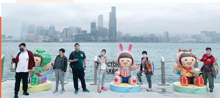
Volunteers took the members on a day trip to give their carers some respite.

Through the "Caring Buddies - Home Respite Programme for the Intellectually Disabled", a programme funded by the Lee Hysan Foundation, we continued to recruit members of the community as caring buddies, whose responsibility is to provide home respite care and companion care services for people with intellectual disabilities, in order to ease the burden on their carers. The programme engaged 174 volunteers, who helped to deliver more than 2,300 service sessions to our beneficiaries.