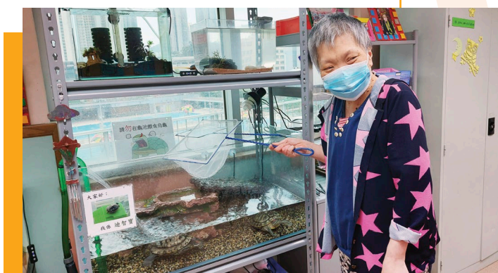
Activities were held to engage service users in life education through caring for small animals.