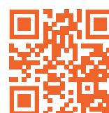
Learn more about Tsui Lam Integrated Vocational Rehabilitation Service

Tsui Lam Integrated Vocational Rehabilitation Service has been working closely with a local designer brand named Alchemist Creations Co. Ltd. for years, in order to engage its service users in the process of upcycling aluminium cans into environmentally-friendly products. In mid-2022, the brand once again partnered with Tsui Lam Integrated Vocational Rehabilitation Service to produce a giant art installation with the theme of “We Can Shine”. The installation, displayed on the Wan Chai promenade, was composed of more than 10,000 sparkling gemstones made from beverage cans. After collecting and processing the used aluminium cans, our service users helped to polish the aluminium pieces to resemble shining gemstones, carrying the message that anyone can shine with the right training.