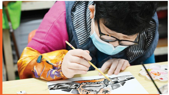
Our service users learned to create various forms of art and express their inner thoughts through paintings.

In an ongoing effort to promote artistic innovation among people with disabilities, and to refine their aesthetic sensibilities and creative techniques, Tsui Lam Integrated Vocational Rehabilitation Service and Assisted Employment Services will continue to encourage participation in a variety of special art training programmes and open up further development opportunities for people with disabilities. We will also try to transform our service users' creations into different products to enhance both their practical and ornamental value.