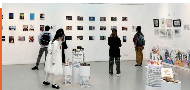
The art exhibition featured more than 150 drawings and photographic works created by people with disabilities.