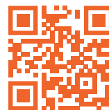
Video Highlights from the “Smile · U are Beautiful” Exhibition

Tsui Lam Integrated Vocational Rehabilitation Service and Assisted Employment Service organised an art exhibition at VESSEL, Kwun Tong, from 17 th to 19 th March 2023, showcasing more than 150 artworks by people with disabilities, including oil paintings, watercolours and technical-pen drawings. Some photographic works, including ones shot by the students on black-and-white film and colour photography, were also exhibited. Each piece of work was accompanied by a written description of the artist’s mental process and journey of rehabilitation, which shed light on the artistic creation process and demonstrated how our service users discovered their personal style and potential through 44 art classes, bearing testimony to our commitment to promoting the artistic development of people with disabilities. The exhibition received positive feedback, with visitors describing it as a contagious and empowering experience of artistic sharing. A total of 1,525 public visitors attended the three-day exhibition.