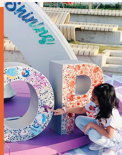
Each sparkling gemstone was hand-crafted and polished by our service users from recycled aluminium cans.

Tsui Lam Integrated Vocational Rehabilitation Service has been working closely with a local designer brand named Alchemist Creations Co. Ltd. for years, in order to engage its service users in the process of upcycling aluminium cans into environmentally-friendly products. In mid-2022, the brand once again partnered with Tsui Lam Integrated Vocational Rehabilitation Service to produce a giant art installation with the theme of “We Can Shine”. The installation, displayed on the Wan Chai promenade, was composed of more than 10,000 sparkling gemstones made from beverage cans. After collecting and processing the used aluminium cans, our service users helped to polish the aluminium pieces to resemble shining gemstones, carrying the message that anyone can shine with the right training.