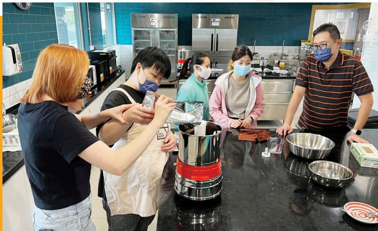
An expert chocolatier taught our staff members and service users how to make chocolate.

Learn more about Tsui Fung Co-production Centre