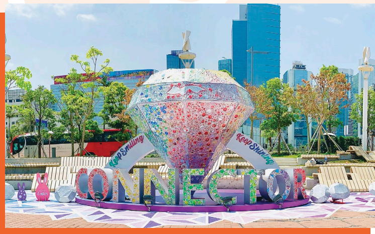
The art installation, named “We Can Shine”, was embellished with more than 10,000 “Can Gems” made by our service users, symbolising the fact that any ordinary person can be transformed into a priceless gem.