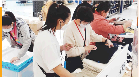
Our service users underwent training in clothing stores to gain valuable hands-on experience.

Tsui Ngai Co-production Centre cooperated with several employers to provide its service users with a variety of job opportunities and pre-service training. Through real-life scenarios and related training programmes, the participants gained deeper insights into the demands and requirements of the open job market, as they prepared for job searching in the real world. Last year, eight more caring employers and seven service users joined the programme.