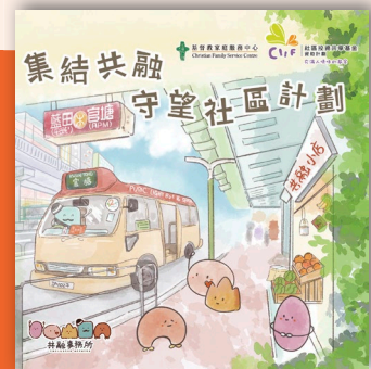
The “Inclusion and Care Together” project promotes the concept of inclusiveness through diverse community activities.

Inclusive Affairs received a grant of around HK$3 million from the Community Investment and Inclusion Fund (CIIF) to launch a three-year project called “Inclusion and Care Together” across Kwun Tong District in April 2023. Built on a cross-sectoral collaboration model that brings together the community, non-profit organisations and businesses, the project seeks to promote inclusion and raise community awareness of the wellbeing of people with intellectual disabilities and their carers through outreach activities such as street booths and talks. Members of the community will be recruited and trained to become “Inclusive Buddies”, in order to support the needs of people with intellectual disabilities and their carers, and to form a network of mutual assistance and support in each neighbourhood. Carer support groups will also be organised to integrate different sectors into a collaborative network to foster and build an inclusive community. The project is expected to connect up to 25,000 participants, volunteers and community members.