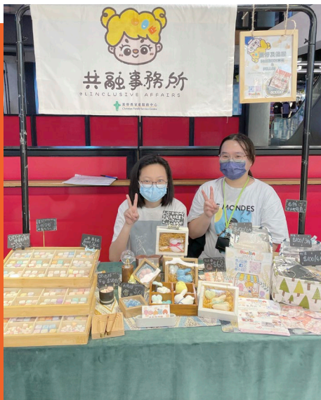
Service users got a one-day experience of running a market stall at the Inclusive Bazaar.

Inclusive Affairs was established in October 2022, as one of our initiatives to promote opportunities and inclusion for people with disabilities. The service users are given the opportunity to act as a stallholder for a day, where they get hands-on experience in the making, packaging, promotion and sale of products, in order to showcase their capabilities and talent to members of the public and realise their potential.