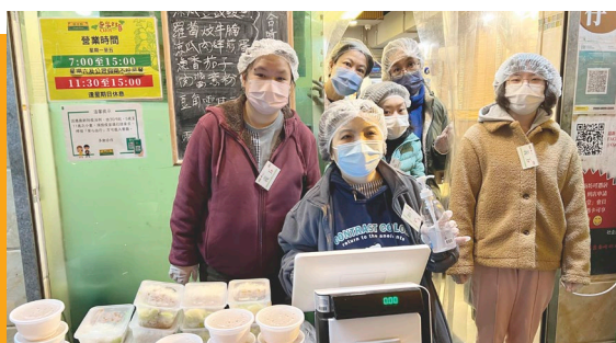
Our service users delivered free meals in Sham Shui Po District during an activity held by local organisations.

Tsui Ngai Co-production Centre is committed to collaborating with community partners and expanding its employer networks in Sham Shui Po District. We not only seek job opportunities for our service users, but also deepen the mutual understanding and connections with members of the community, in order to spread the message of inclusion. Last year, we built links with 22 organisations and employers across Sham Shui Po District. We strongly believe in our service users’ potential for growth as not just the recipients of help, but also as contributors to society. Through organising a variety of community programmes and volunteer opportunities, we are confident that they are being set up for enriching and fulfilling lives.