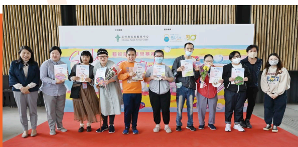
Participants were gifted with a coaster printed with their own drawing as a meaningful token of appreciation.