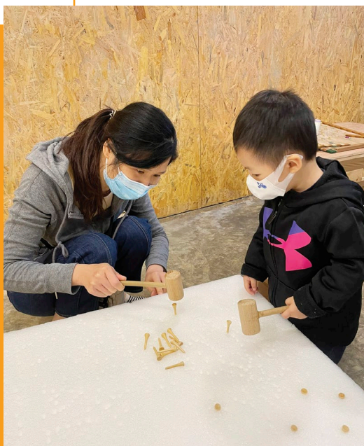
Family support services included home-based parenting guidance, parent-child activities, medical consultations and home improvements.