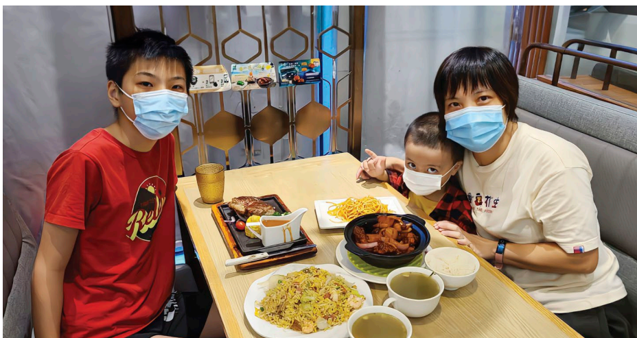
On the eve of the Mid-Autumn Festival, meal coupons were distributed to 500 grassroots families with schoolchildren.

Our Community Development Services has once again collaborated with the Hong Kong and China Gas Company Limited to organise the “Love on Delivery at Mid-Autumn - Celebrating the Festival with Neighbourhoods” event. On the eve of the Mid-Autumn Festival, meal vouchers were given to 500 underprivileged families with school-aged children, symbolising the warmth and care felt for each family during this reunion festival. At the same time, the families were invited to identify their neighbours who had not yet accessed social services. In addition to extending festive greetings, the event also aimed to introduce our local social services to them, thereby gradually establishing mutual support and a caring community network.