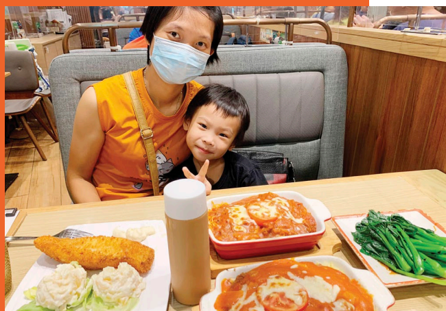
Participating families enjoyed warm mealtime moments with their loved ones.