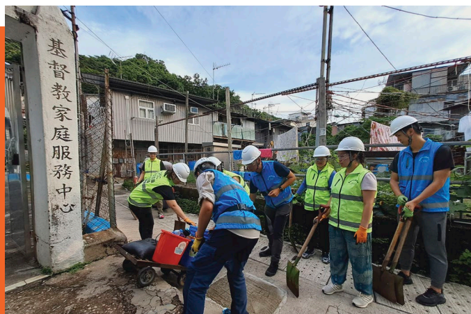
The Community Disaster Preparedness Programme, set up by the Agency, helped residents in squatter areas prepare for typhoons and provide post-typhoon relief.

Underprivileged family members continue to be the primary service targets of our Community Development Services. In addition to residents living in squatter huts and subdivided units, over a thousand families residing in inadequate housing will be moved into the units of our Transitional Housing Projects in the coming year. While reaching out to a wider range of service users, we will further strengthen our collaborations with various stakeholders to address the needs of different vulnerable groups through diversified services. At the same time, we will promote community engagement and encourage everyone to give back to our society, in order to realise our roadmap where adequate housing supports the building of harmonious families, which will eventually facilitate the creation of a caring community.