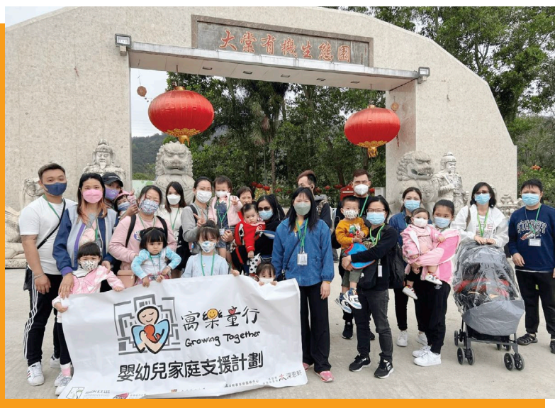
The “Home Learning Programme for Underprivileged Families” was launched in August 2022, to support families with infants and young children.

Sponsored by the Simon K.Y. Lee Foundation and coordinated by the Chinese University of Hong Kong and the City University of Hong Kong, the “Home Learning Programme for Underprivileged Families” is based on the Routine-Based Early Intervention (RBEI) model. It provides early support for families living in subdivided units with infants and toddlers aged 0-3 years. The intervention includes 12 home visits, during which parenting guidance is provided, including parent-child activities, parental support and medical consultations. It is expected that through early interventions, the programme can strengthen the grassroots parents’ capacity for supporting their infants and toddlers’ overall development, despite the limitations related to their home space, which in turn will enhance the family’s cohesion and functionality, thereby facilitating the development of these infants and toddlers.