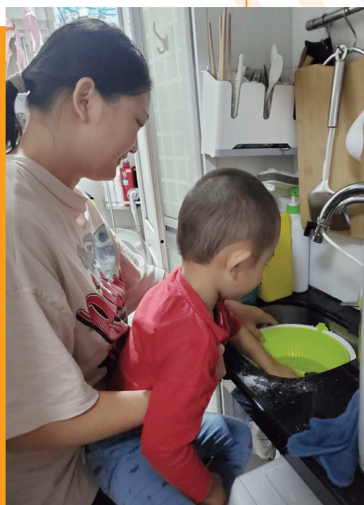
Social workers and preschool teachers of the programme will work with parents individually to establish an environment suitable for the growth and learning of infants and toddlers.