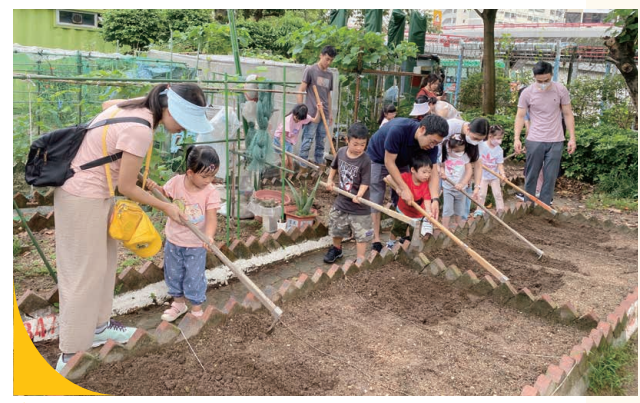
Parents cultivated a plot of farmland and learned about organic farming concepts with their children.

Last year, Urban Oasis organised 34 half-day agricultural workshops for parents and children, with support from the HSBC Hong Kong Community Partnership Programme. The events, which were designed to improve parent-child relationships through farming practices, were enjoyed by nearly 800 participants. Urban Oasis also participated in various large-scale exhibitions, including the Hong Kong Brands and Products Expo, Hong Kong North District Flower Bird Insect and Fish Show, the Wong Tai Sin Lantern Festival and the Hong Kong Flower Show, in order to advocate urban agriculture and showcase its eco-friendly products.