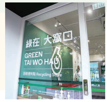
"GREEN@KWAI FONG" and "GREEN@TAI WO HAU" now offer recycling services to nearby residents.