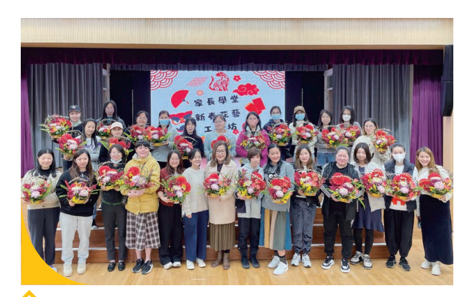
Aparents learned to create New Year floral arrangements.