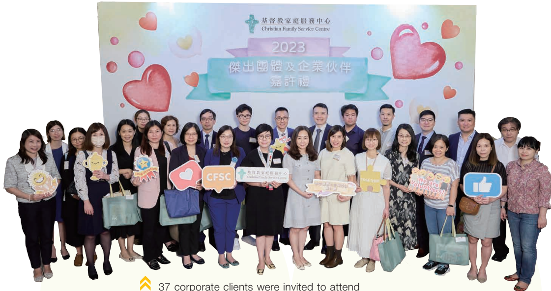
37 corporate clients were invited to attend the Corporate Recognition Ceremony.

Last September, Vital presented 37 corporate partners with the “Employee Wellness Commitment 10+” and “Employee Wellness Commitment 15+” commendations during the “Corporate Recognition Ceremony 2023”, as a token of our appreciation for their ongoing efforts in the implementation of EAP and their commitment to caring for employee wellbeing. The corporate representatives also had an opportunity to visit the booths of other service units, exploring the potential for further partnership opportunities with CFSC to foster a corporate culture that prioritises community wellbeing.