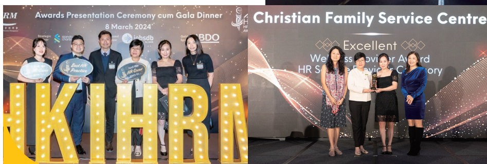
Our team witnessed the moment of glory, as Vital received the Excellent Wellness Provider Award at the HKIHRM HR Excellence Awards Presentation Ceremony.