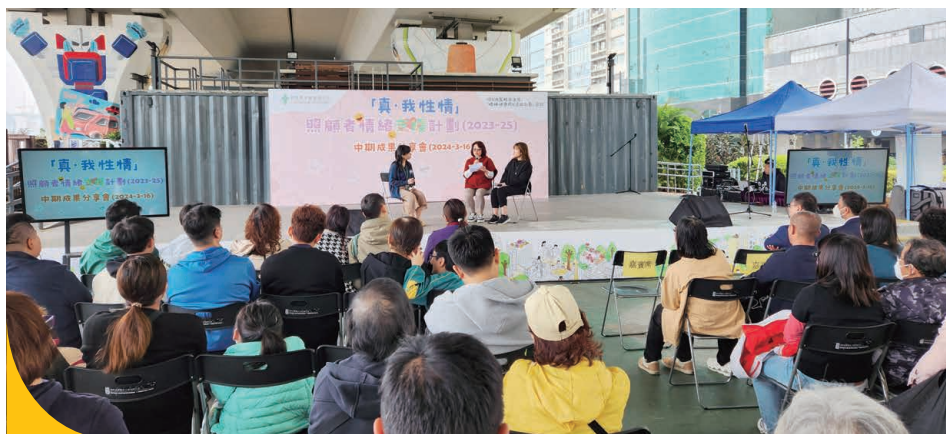
⚡ The participating carers gave positive feedback during the mid-term sharing session of the programme.