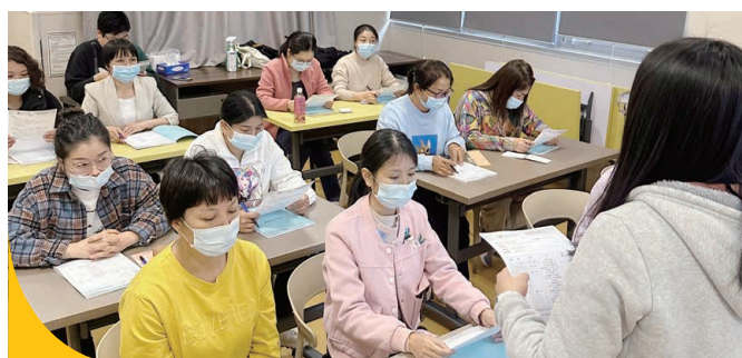
⚡ Care workers received pre-service training as part of the “Special Scheme to Import Care Workers for Residential Care Homes”.

As a hostel providing a high level of care for people with disabilities, Sheung Seen House applied to enter the “Special Scheme to Import Care Workers for Residential Care Homes” offered by the Social Welfare Department in 2023 to secure its frontline workforce. In December 2023, a total of seven care workers joined the care team under this scheme. In addition to pre-service training, they also participated in retreats and team-building activities, learning to improve the quality of their care alongside their local peers.