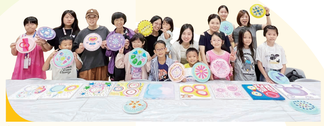
With a focus on family mental health, a diverse range of educational programmes and support services are arranged to improve public knowledge about physical, mental, social and spiritual well-being.

As a key strategy to promote better mental health, we advocate for "self-care" by organising educational activities, forming community support networks and conducting joint research with other sectors. Our services are centred around exploring the relationship between a family and an individual's mental health development through research on physical, mental, social and spiritual health indices, and by providing relevant recommendations and support for those in need. In addition, we provide skills training to our staff and adopt an evidence-based method to support vulnerable individuals within the community, with the goal of promoting self-care and fostering holistic health.