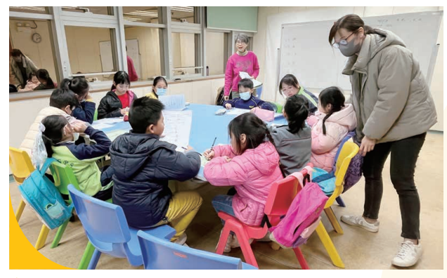
We provide tutoring and extracurricular activities for children from low-income families to encourage their all-round development.