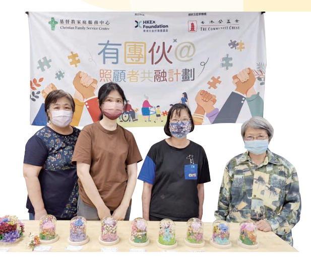
The "Together We Connect@Carer Inclusion Project" utilised horticultural therapy to help carers build resilience and mental strength, and to promote self-care while caring for others.