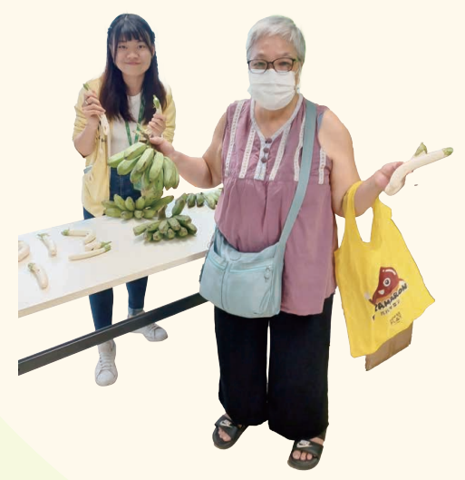
Tangible support is offered to help underprivileged individuals reduce their expenses and improve their quality of life.

We also connect and collaborate with various sectors to provide learning and development opportunities for social vulnerable groups. This includes securing disability-friendly job positions and work experience for people with intellectual or other disabilities, and offering free health check-ups for underprivileged individuals with disabilities.