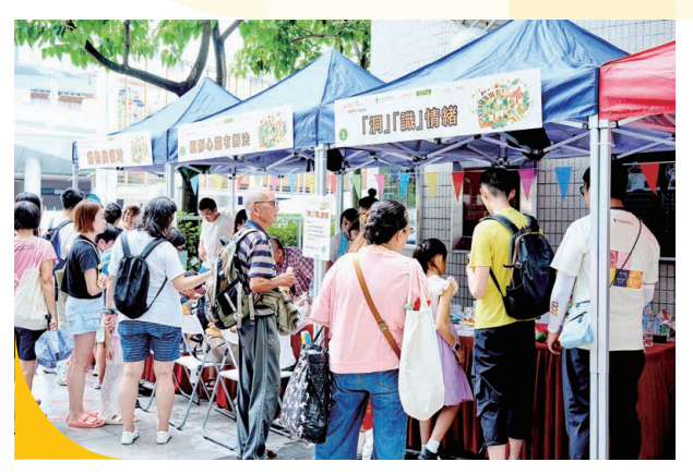
We promote the concepts of health through various educational activities and provide the corresponding support.