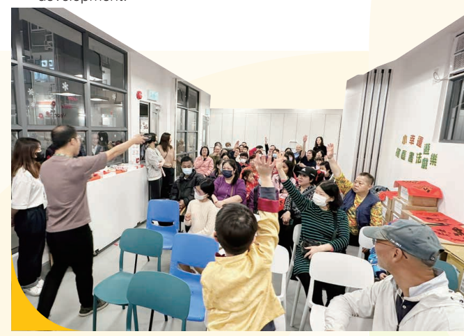
We promote cross-sector collaborations to embed inclusivity and the spirit of care into the fabric of disadvantaged communities.