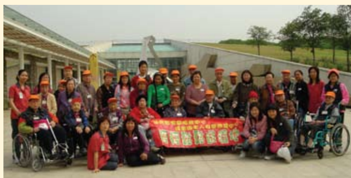
長者日間護理中心舉辦秋季大旅行，義工及同事帶領中心會員及家屬暢遊濕地公園，舒展身心。 Members and family members of the Day Care Centre enjoyed a day of visit to the Wetland Park for celebrating the Mid-Autumn Festival

Macau Federation of Trade Unions Mong Ha Elderly Centre visited Kwun Tong Integrated Home Care Services for sharing experience in operating home-based services for the elderly